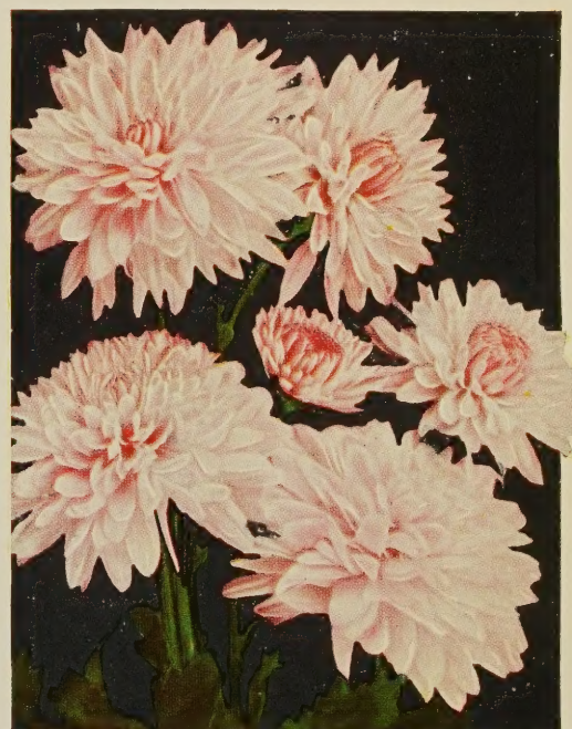
APPLE BLOSSOM. 60c each; 3 for $1.50